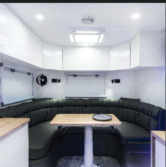
Contemporary Design Furniture