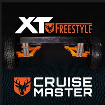
Off Road chassis Independent Suspension