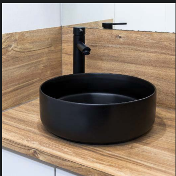
Premium Finish Design Features