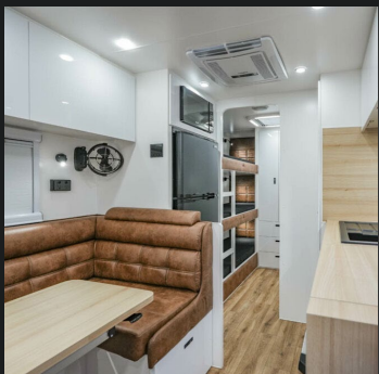
Contemporary Design Furniture