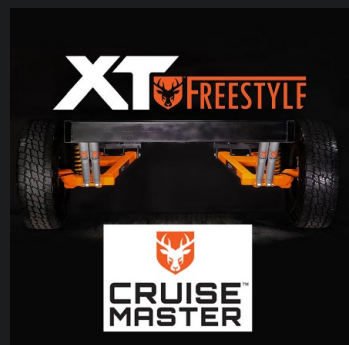
Off Road chassis Independent Suspension