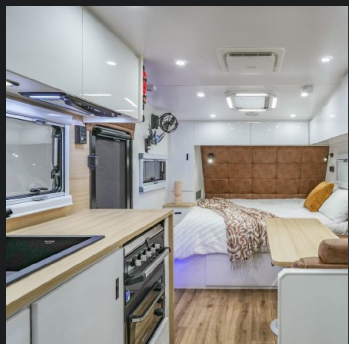
Premium Finish Design Features