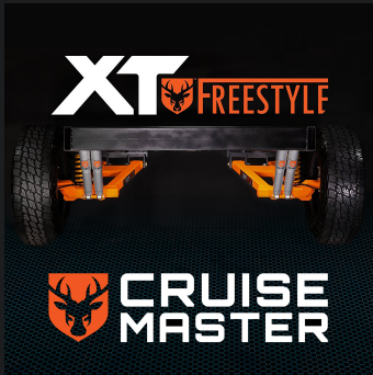
Off Road chassis Independent Suspension