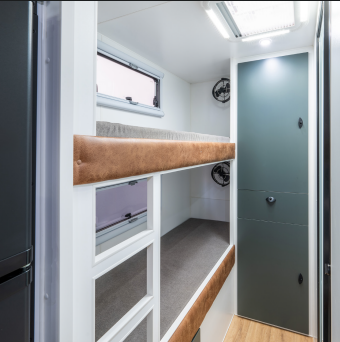
Contemporary Design Furniture