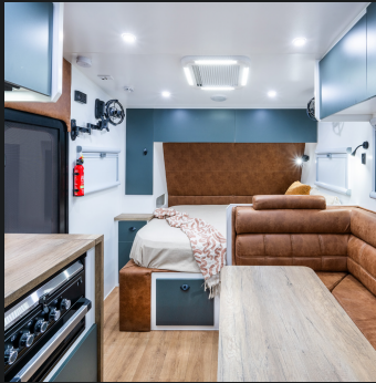
Modern Kitchen Appliances