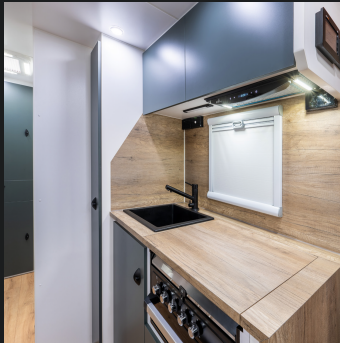
Premium Finish Design Features