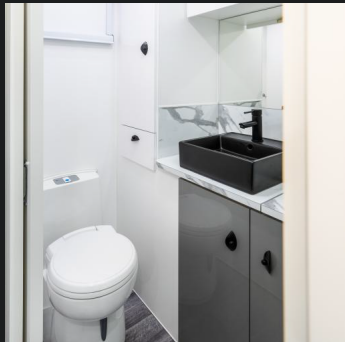
Premium Finish Design Features