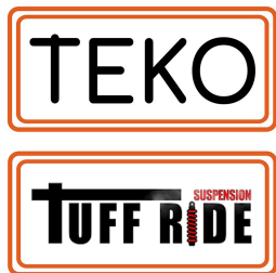
Off Road chassis Independent Suspension