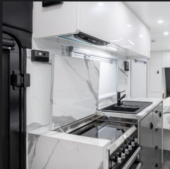
Modern Kitchen Appliances