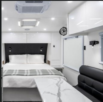
Contemporary Design Furniture