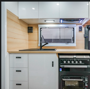
Modern Kitchen Appliances