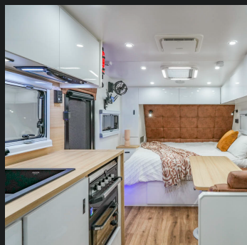
Premium Finish Design Features