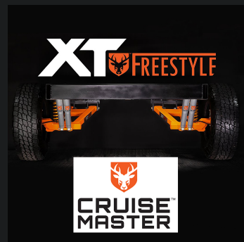
Off Road chassis Independent Suspension