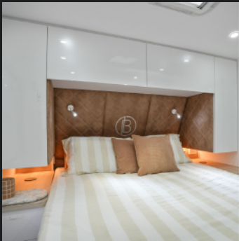
Premium Finish Design Features