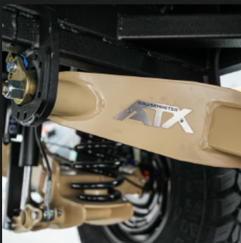
Off Road chassis Independent Suspension