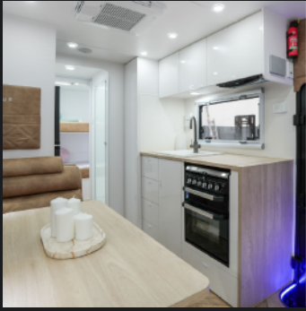
Modern Kitchen Appliances