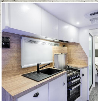
Modern Kitchen Appliances