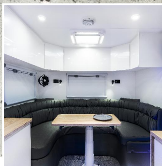
Contemporary Design Furniture