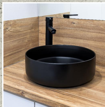
Premium Finish Design Features