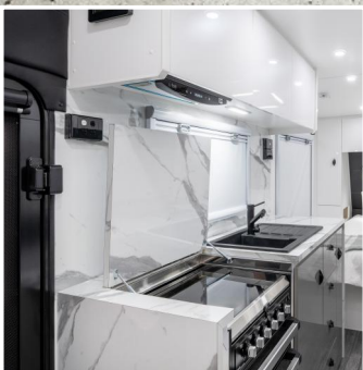
Modern Kitchen Appliances