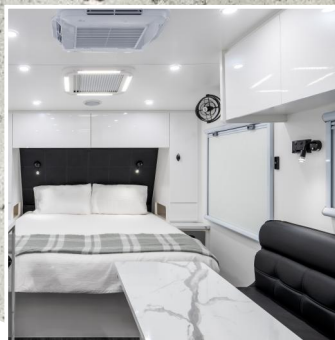
Contemporary Design Furniture