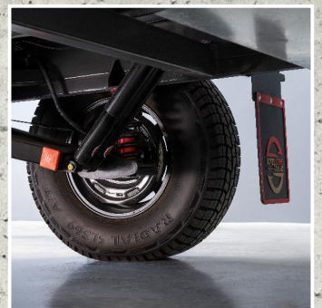
Off Road Chassis with Independent Suspension