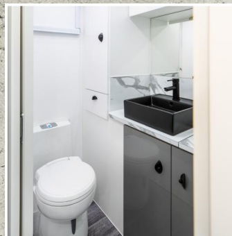
Premium Finish Design Features