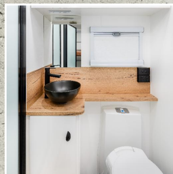
Premium Finish Design Features