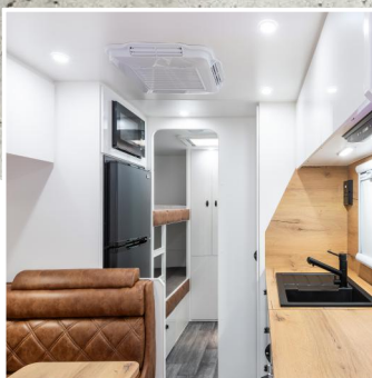
Modern Kitchen Appliances