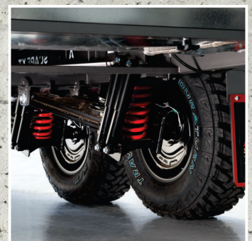
Off Road Chassis with Independent Suspension