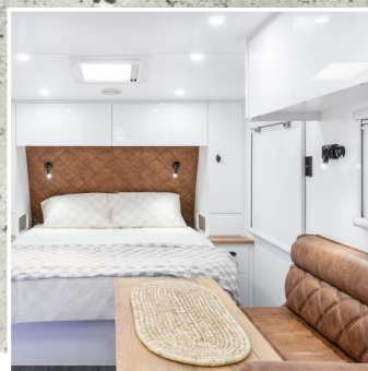
Contemporary Design Furniture